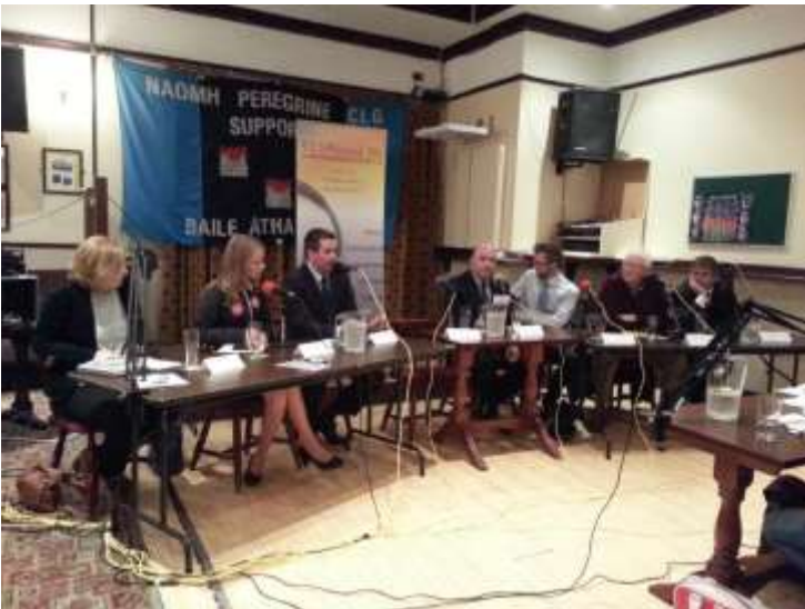
Candidates for the Dublin West By-Election debate in St Peregrine's.

92.5 PHOENIX FM COVERS LOCAL, EU & BY-ELECTIONS