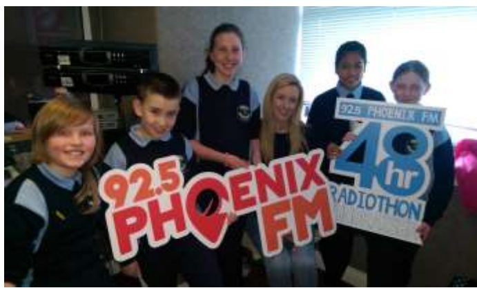
The crew St Mochta's School 5 th Class during the successful 48 Hr Radiothon Fundraiser

Following on from last year's inaugural event, March 2015 saw 92.5 Phoenix FM host its second 48Hr Radiothon fundraiser. Starting at midday on Wednesday, March 25 and ending on midday Friday, March 27, the Station successfully broadcasted for 48 successive sponsored hours. Here at 92.5 Phoenix FM, we would like to thank everyone who participated in the Radiothon as well as anybody who donated to our cause. The Radiothon is one of the biggest fundraising events in our calendar and the money raised is vital to keeping the Station running. This year the Station once again raised over €3,000.